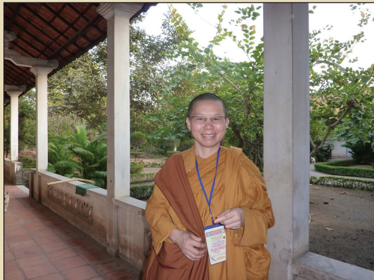
Sakyadhita Conference Vietnam