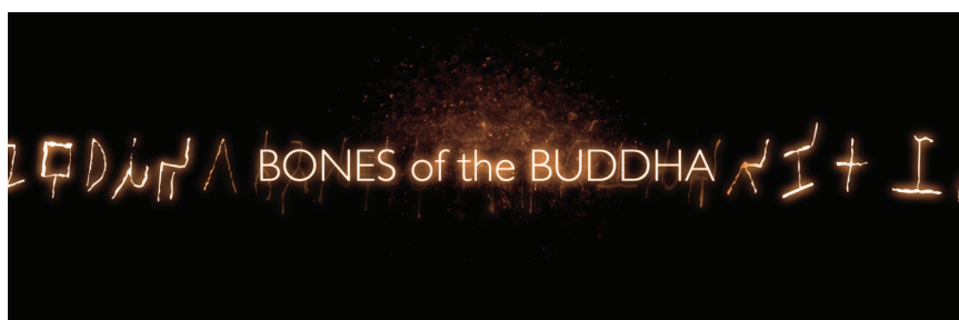
FIGURE 1. Screenshot from the title shot, Bones of the Buddha , 2013. Television documentary produced by Icon Films and commissioned by WNET/THIRTEEN and ARTE France for the National Geographic Channels

Revisiting the Piprahwa relics, this paper moves away from such definitive conclusions on their authenticity. The study focuses instead on the journeys and material reconstitutions of ancient Buddhist corporeal relics as they travelled from an archaeological site in British India, Piprahwa Kot, to a new relic temple in Bangkok, the capital of the Kingdom of Siam (Thailand), during the late nineteenth century. Building on textual and visual archives of colonialism and