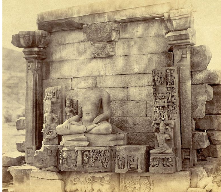
The 8th/9th century shrine, now vanished

The great stupa was not the only monument at Bharhut. Near it, Cunningham discovered a monastery that had been inhabited until the 10th century, several smaller stupas and a large beautifully decorated temple with a Buddha statue still in it dating from 8th or 9th centuries.