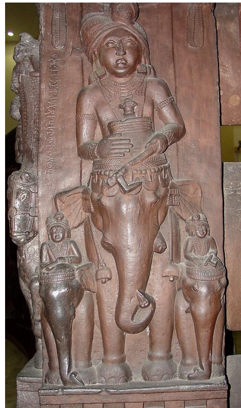
Decorated elephant carrying a relic casket in procession

One of the most interesting of the other carvings shows a turbaned and bejewelled man riding an elephant and carrying a casket containing Buddha relics. It would seem that there had been a festival at Bharhut, perhaps once a year, when the stupa's relics were carried in procession, reminding one of the annual Kandy Perahera in Sri Lanka. One interesting thing about the female figures carved on the railing pillars is that some of them are depicted with tattoos which must have been fashionable at this time. Some of the women have star, moon or flower-shaped tattoos on their cheeks, breasts, and upper arms.